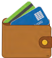
Book Systems Pay